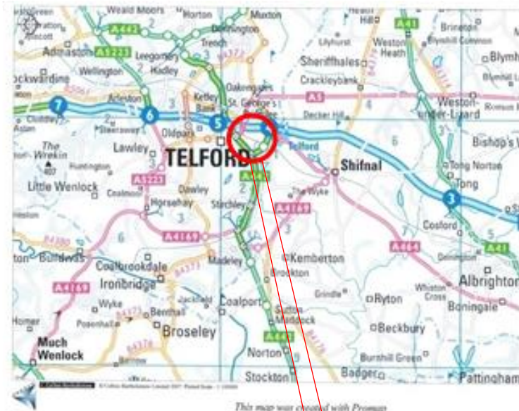
This map was created with Promap